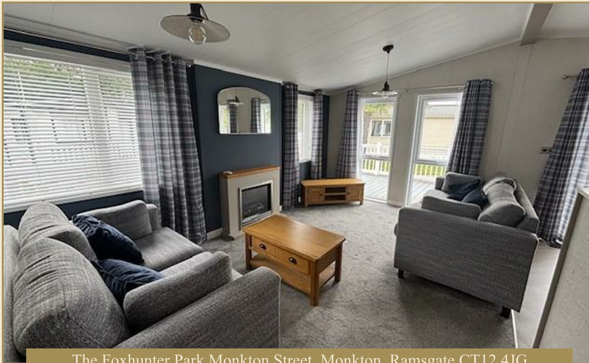
The Foxhunter Park Monkton Street, Monkton, Ramsgate CT12 4JG